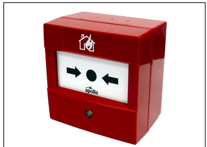
Part no 55200-001 - Conventional Manual Call Point (indoor only, outdoor not shown)